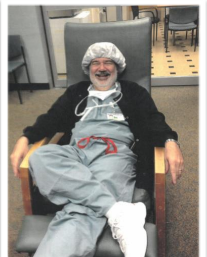
Enjoying a break in his favorite recliner.