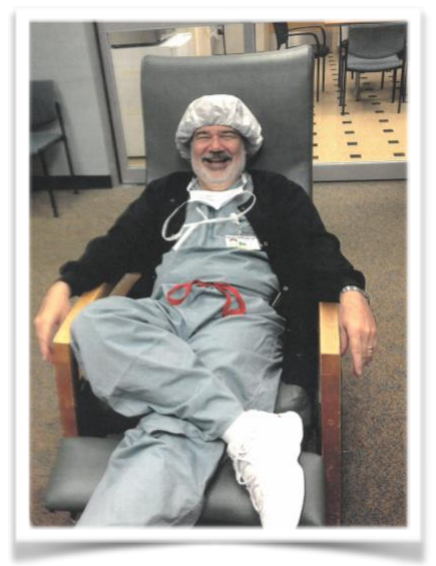
Enjoying a break in his favorite recliner.