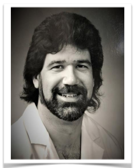
THI staff photo, early 1990's.